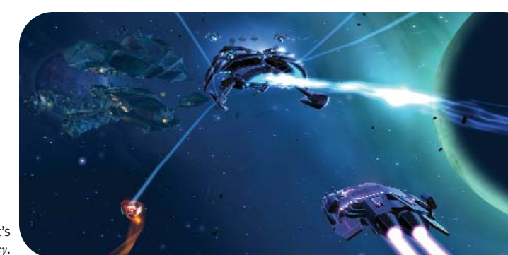
Artech Digital Entertainment's Aces of the Galaxy.

And, like limited market access, lack of capital can make it more difficult to develop and retain Canadian talent.